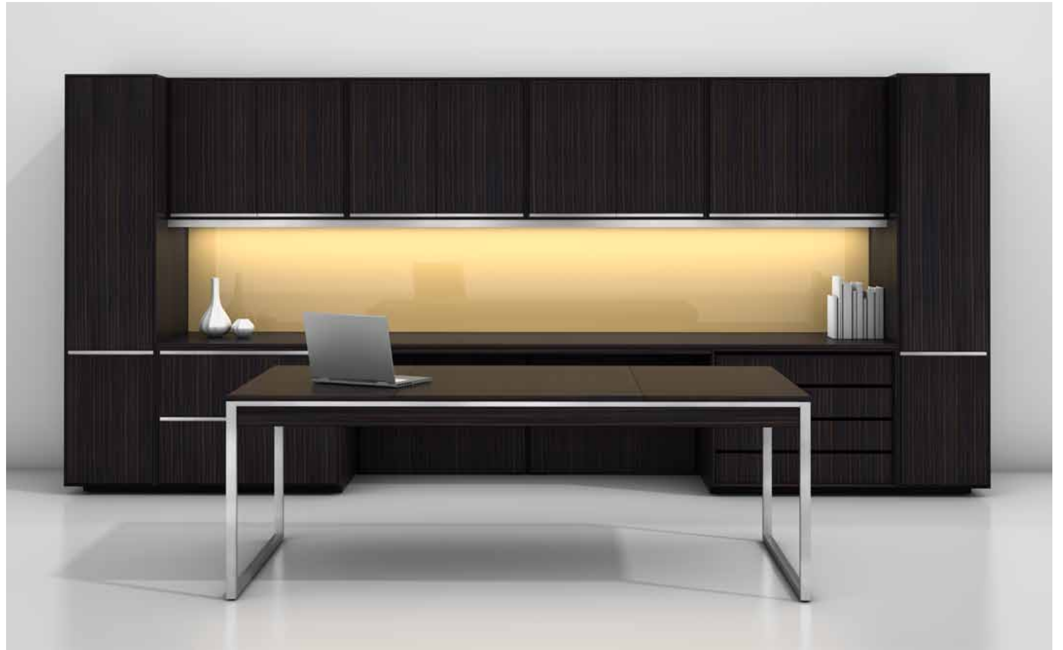
The finely crafted GL collection offers distinctive finish options for creating understated or dramatic design statements. Shown in Quarter Cut Ebony, Brushed Stainless Steel