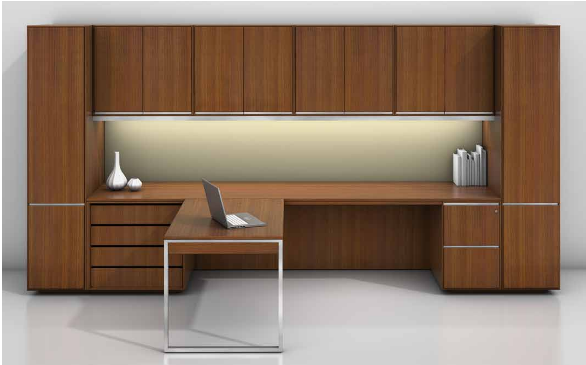
Storage components and work surfaces may be configured to suit virtually any enclosed or open space and diverse functional requirements. Shown in Quarter Cut, North American Walnut, Brushed Stainless Steel.